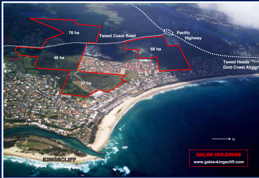
Aerial view over Kingscliff

FOR THE GATEWAY TO THE TWEED COAST AT THE HUB OF THE SHIRE